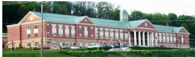
Lewistown High School is at 501 6th Street, Lewistown, PA 17044